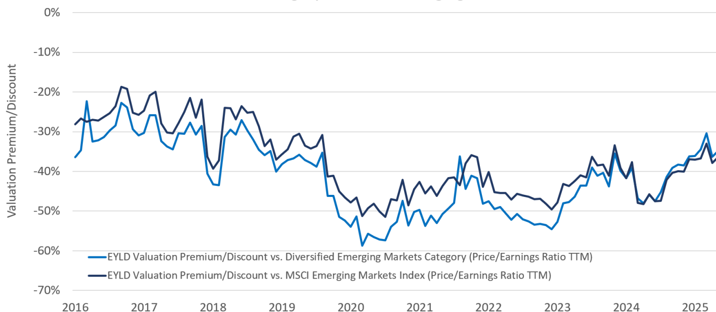
EYLD Valuation Premium/Discount vs. Morningstar Diversified Emerging Markets Category and MSCI Emerging Markets Index